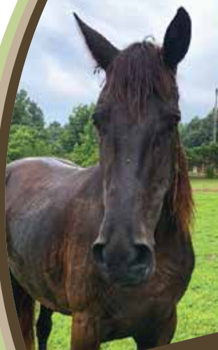
MAGGIE Rescued 2017

www.neahs.org facebook.com/HumaneSocietyNEA