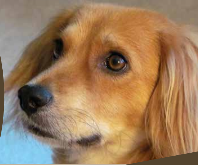
SKIPPER Rescued 2008